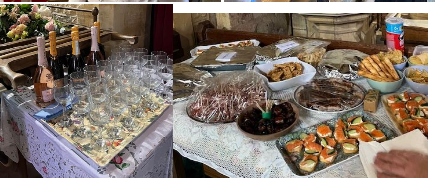
Front and back cover: Photos from Catherine's Farewell Service on Sunday 8 September 2024